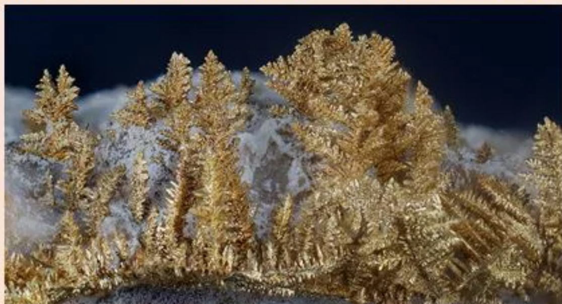
Gold Crystals from Hopes Nose, Torquay, Devon.

Over 40 dealers with minerals, gems, fossils, meteorites, flints, books, & accessories for sale